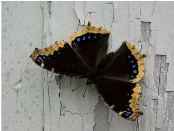
Mourning Cloak adult - Alex Haro

If you want to see a Mourning Cloak butterfly this spring, look along rivers and streams, and in forests, parks, gardens, and sunny openings. The adults are not overly fond of flower nectar;